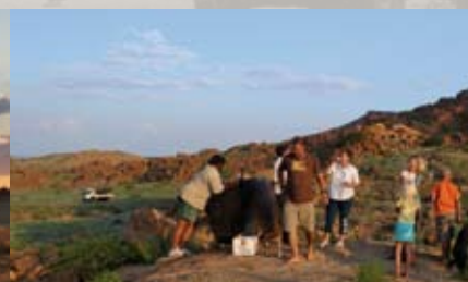
The Ugab river valley is a true paradise for bird and game watchers, hikers and other nature lovers