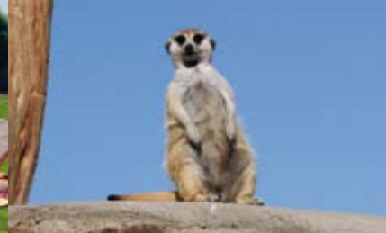
Welcome at our oasis